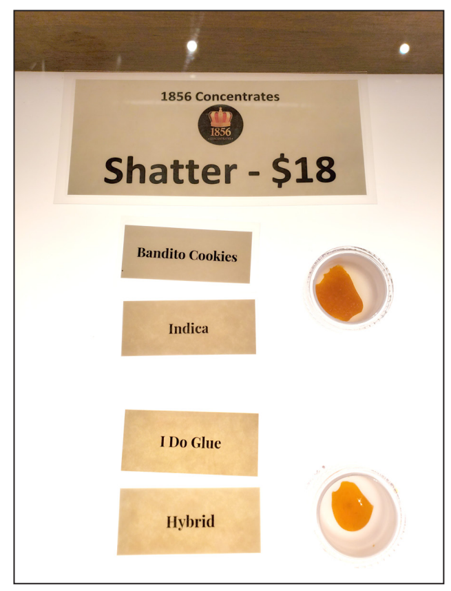
Figure 1. Shatter marijuana is also known as BHO. It is a hash oil concentrate produced by the use of butane solvent to derive high THC levels from the marijuana plant.