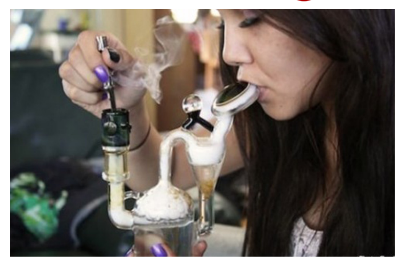
Figure 2. Dabs are typically heated on a hot surface with the vapors inhaled through a dab rig or dab pen. Dabs are now used frequently by high schoolers and increasingly elementary students in Colorado and other legal recreational marijuana states.